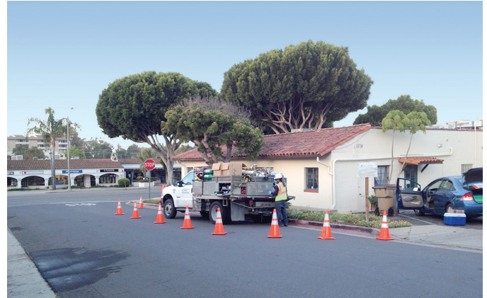
DBS&A field work provided the data that demonstrates vapor mitigation is not needed at the Site.

Ultimately, DBS&A's work at the site will result in cleanup of the relatively extensive VOC groundwater plume at the site and in the vicinity and reduce current and future site financial environmental liabilities for the San Roque Cleanup Fund. DBS&A is developing a public participation program that includes a neighborhood concerns survey, public meetings, an informational website, and a public information fact sheet.